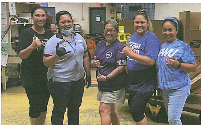
Members of the Big Island Area Local on APWU Union Pride Day 2022 celebrating our record-breaking COLA.

We urge all APWU members to encourage your non-member coworkers to join the union. Remind them - it pays to belong to the APWU!